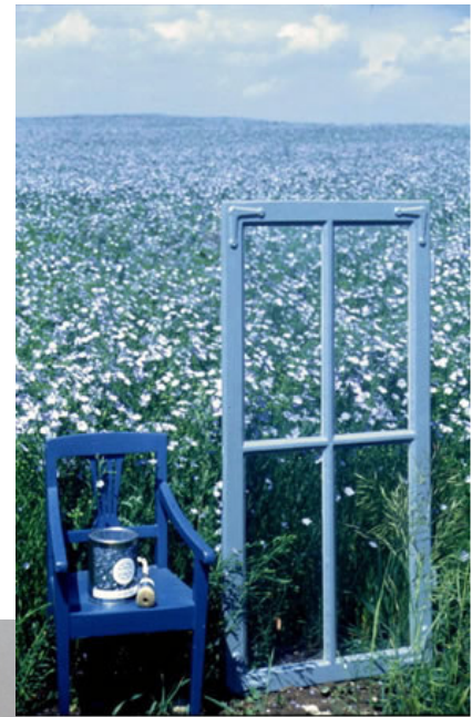
Linseed oil paints