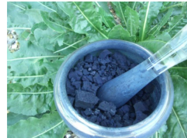
Woad pigment