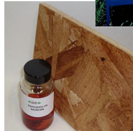
Vegetable resin - © Cambridge Biopolymers